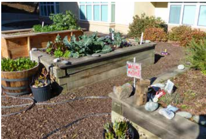
The community created garden in partnership with the Contra Costa Master Gardeners, the PDAT Veterans and staff.

Veterans will attend two groups or more a day. These include anger- and stress-management classes. Classes also teach social communication strategies, techniques to improve attention and memory, and ways to help them think more efficiently and effectively. In addition, veterans also go to a multitude of weekly, individualized treatment sessions like physical therapy, chiropractic, acupuncture, exercise with a dedicated trainer, mental health support, and cogni-