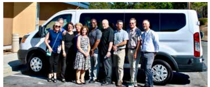
Napa Rotarians drive their 10 passenger donated van to PDAT and share their happiness with the PDAT staff.

When it comes to monetary donations or donated items, everything, Almes says, is documented by Voluntary Services as well as by social workers working with individual or groups of veterans. The VA is scrupulous in making sure donated money is used only for its stipulated purpose.