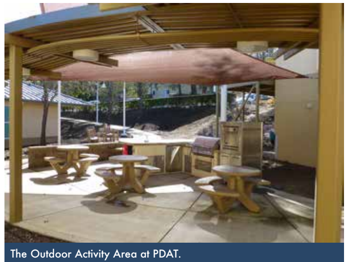
The Outdoor Activity Area at PDAT.

Both Kixmiller and Agcaoili emphasize that when working with a residential treatment program like PDAT, volunteers also need to respect staff time and staff responsibilities. Since staff must accompany the veteran or veterans on almost any outing, all offers of help or outings have to be coordinated with staff to avoid conflicts with other program activities and goals. “We hope volunteers will not be offended if we push back or set limits on activities,” Kixmiller says.