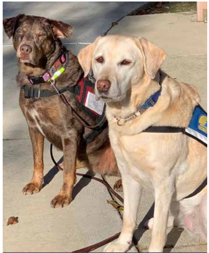
Service dogs are an integral part of the PDAT’s healing program