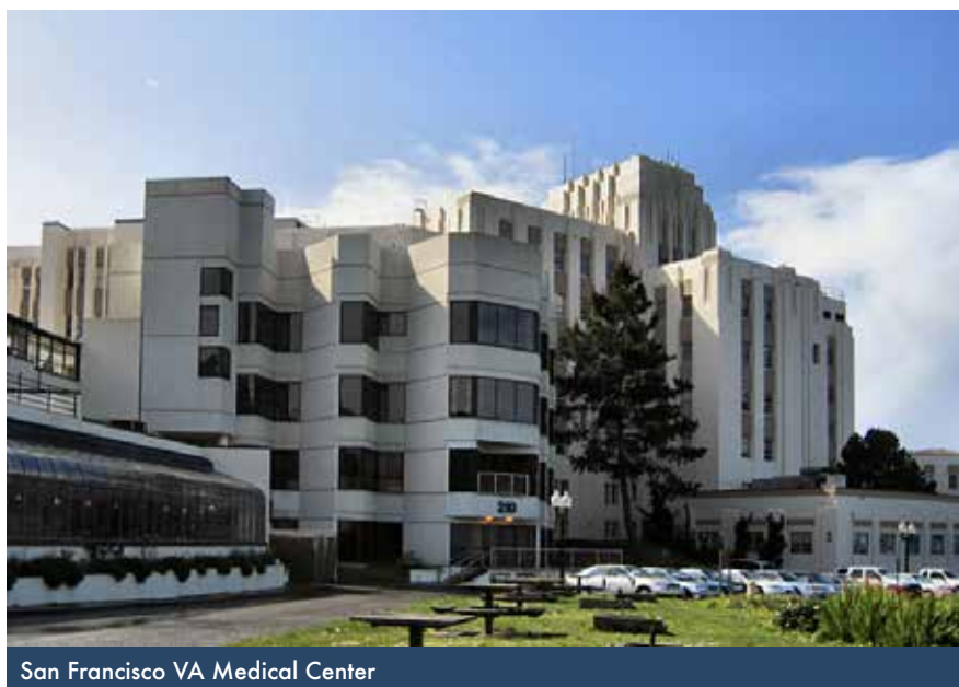
San Francisco VA Medical Center