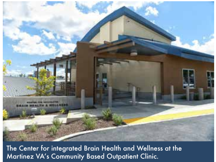
The Center for integrated Brain Health and Wellness at the Martinez VA's Community Based Outpatient Clinic.