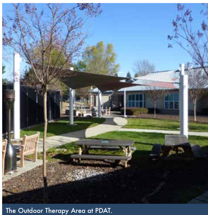
The Outdoor Therapy Area at PDAT.

“I try to coach all the veterans through the worst case scenarios, disappointments, frustration, anger, and key feelings at the root of everything else. That’s why we start with low-stress situations and practice skills and interventions that they can use to deal with their triggers. Then we start working toward more stressful activities. We do simple things like setting up and playing a table game and not blowing up because you’re losing.”