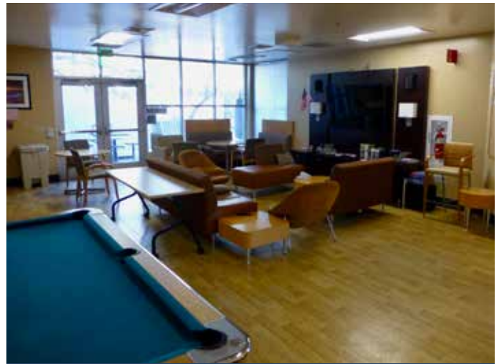
The warm and welcoming group room at PDAT in Martinez where veterans and community members share.

A critical component of a program like PDAT is helping veterans reintegrate into the civilian world. This is where a partnership with Rotarians can be extremely helpful. Kixmiller explains that to move the group of vulnerable veterans outside of their comfort zone requires that “volunteers understand the ins and outs of dealing with veterans who are in a residential program like ours, which includes participation in our intensive treatment program. From the time they wake up until the time they go to sleep, we have constructed a therapeutic program that will help veterans learn coping skills, how to manage their anger, how to deal better